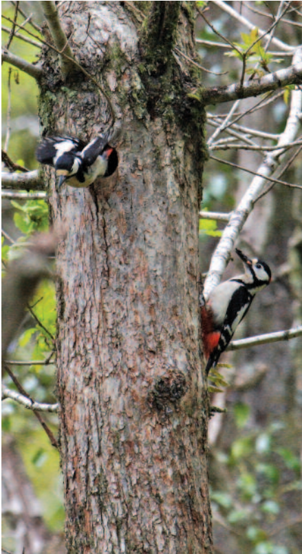
Pair of woodpeckers at nest site.